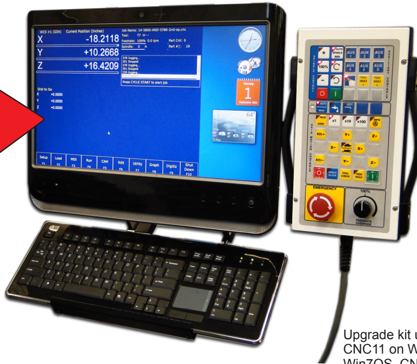
Pre-configured M39 M15 upgrade kit